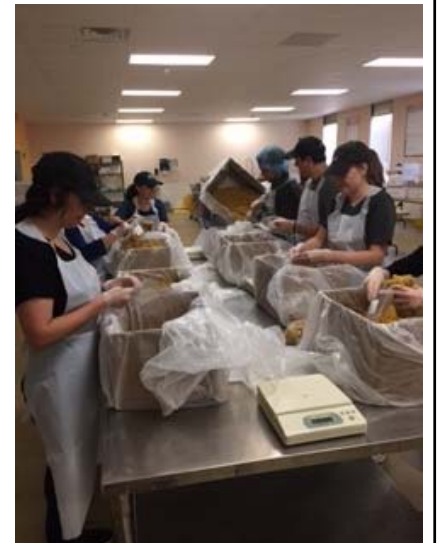
Food Bank Volunteers packing pasta bags

Gina Goodenow can be reached by phone at (212) 251-4042 or by e-mail at GinaGoodenow@gmail.com